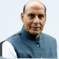
SHRI RAJNATH SINGH Hon'ble Raksha Mantri Government of India

"A strong Indian defence industry will not only make India more secure. It will also make India more prosperous."