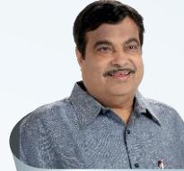
SHRI NITIN GADKARI Hon'ble Minister for Micro, Small and Medium Enterprises and Road Transport and Highways Government of India

"Country's security, welfare of people Government's priority"