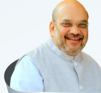
SHRI AMIT SHAH Hon'ble Minister for Home Affairs Government of India

"Homeland security is one of the important areas for the nation's economic development"